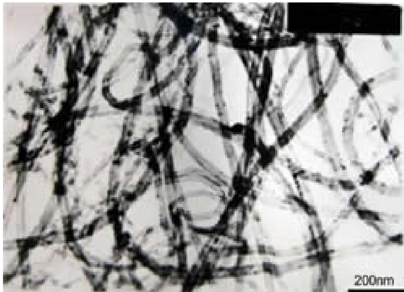
Transmission Electron Microscopy (TEM)